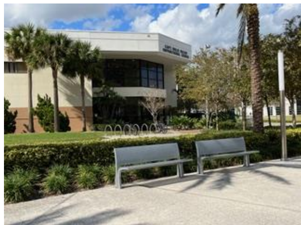
Daytona Beach (KDBA)