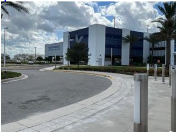
Typical campus outdoor view