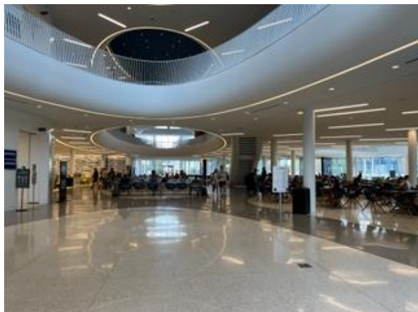
Student Union (Interior)