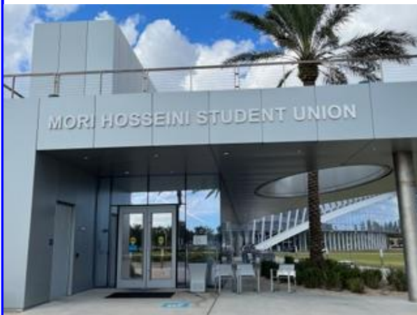
Student Union (Exterior)

Always interested in the aviation industry and how pilots are trained, we searched and found a gem. Our grandson is looking for a college education and pilot training. We visited the Embry-Riddle Aeronautical University on a fact finding mission.